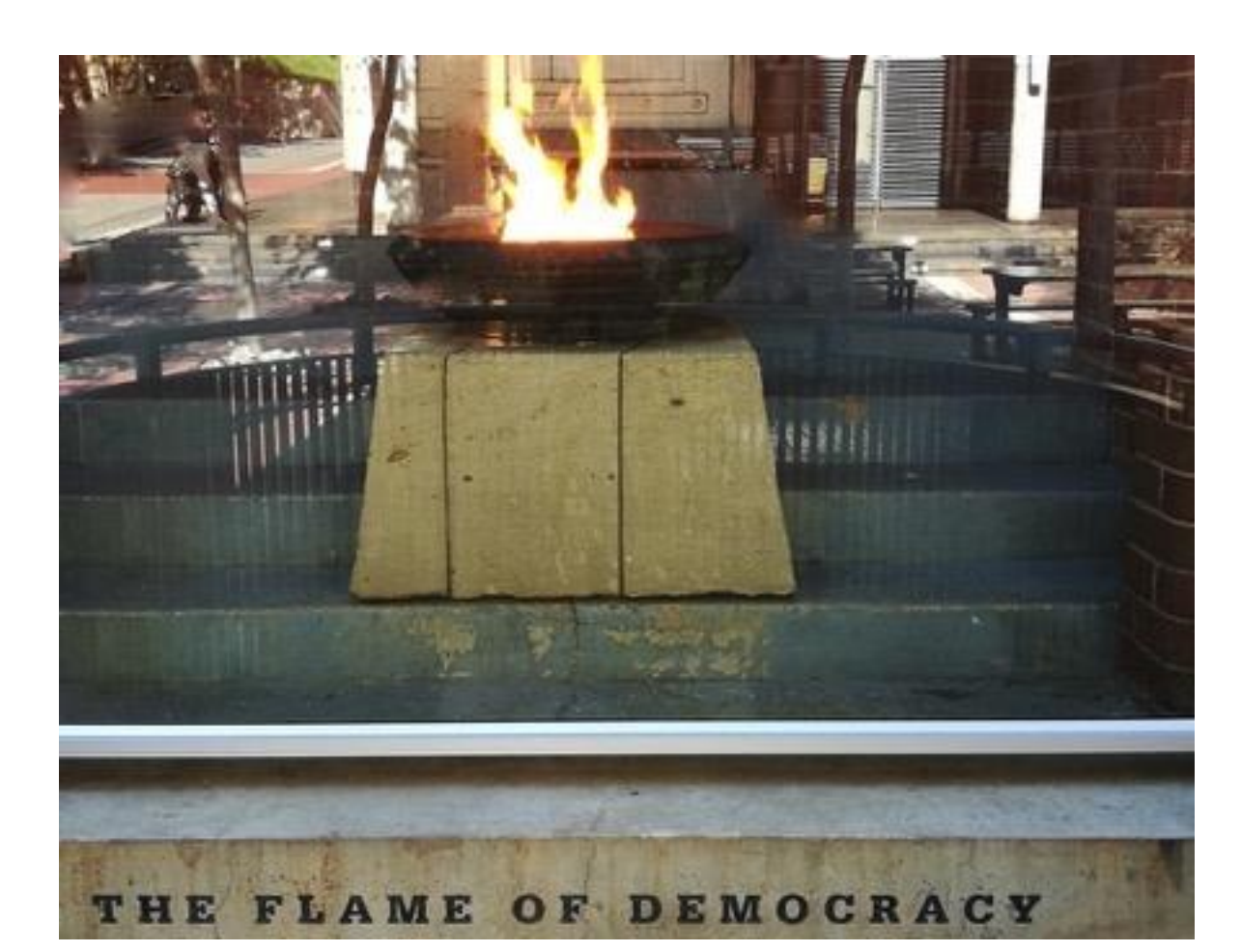
(Constitution Hill, Johannesburg, South Africa)